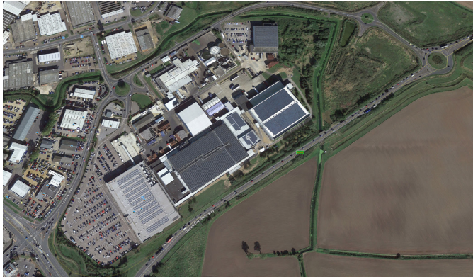
Greenyard Frozen, extent of the site

Greenyard Frozen, King's Lynn, is an 80,000 tonnes/pa facility which processes, packages, and distributes a variety of vegetables including, peas, beans, brassicas and a variety of root vegetables.