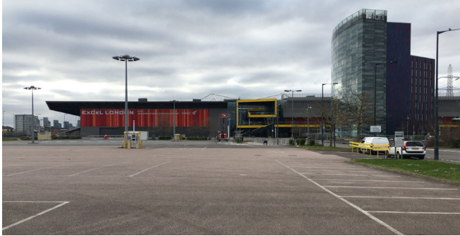
ExCeL Exhibition Centre & eastern car park

The site investigation took place in the eastern car park of ExCeL Exhibition Centre in order to provide information on ground conditions to inform foundation design, contamination assessments, and any remedial measurements required for the construction of a two-storey, 40,000m 2 extension.