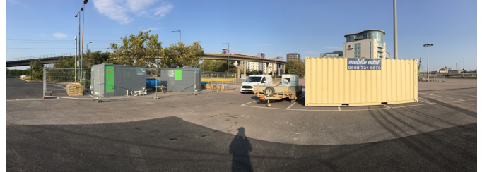
Welfare facilities & Covid-19 compliance. Health and safety methods adopted to work successfully with social-distancing & to minimise cross-contamination risk

The site was set up and ran to facilitate Covid-compliant social distancing, with measures such as additional welfare facilities put in place.