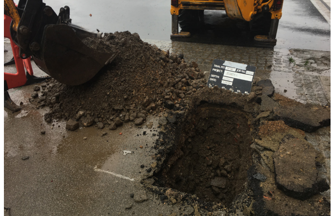
Typical machine-excavated trial pit

The project had tight time-restrictions due to the need to finish intrusive works before a filming project was scheduled. To meet the deadline, Harrison organised multiple aspects of the investigation to be carried out simultaneously and used multiple rigs, which required tight organisation and supervision by our engineers.